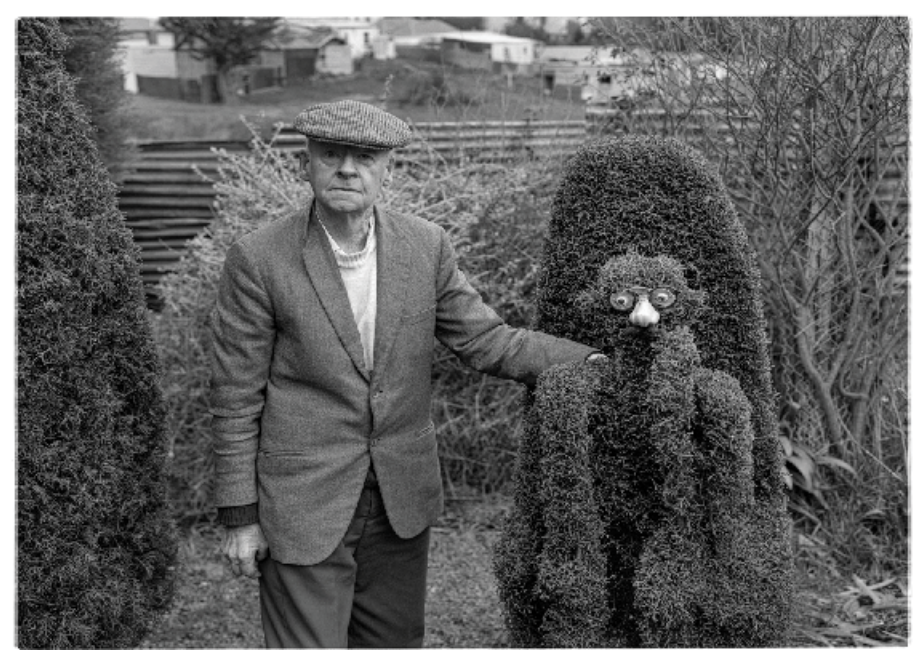
Paul Lambeth, Ballarat East Heritage Project: Mr Luke, Glazebrook St 1992, printed in 2023 from original 5x4 inch negative, 42cm x 59.4cm, Giclee print on Hahnemuhle photo rag.