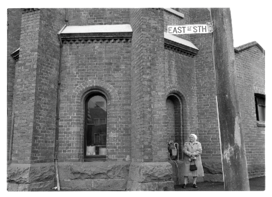
Paul Lambeth, Ballarat East Heritage Project: Fire Station, Barkly and East St Sth 1992, printed in 2023 from original 5x4 inch negative, 42cm x 59.4cm, Giclee print on Hahnemuhle photo rag.