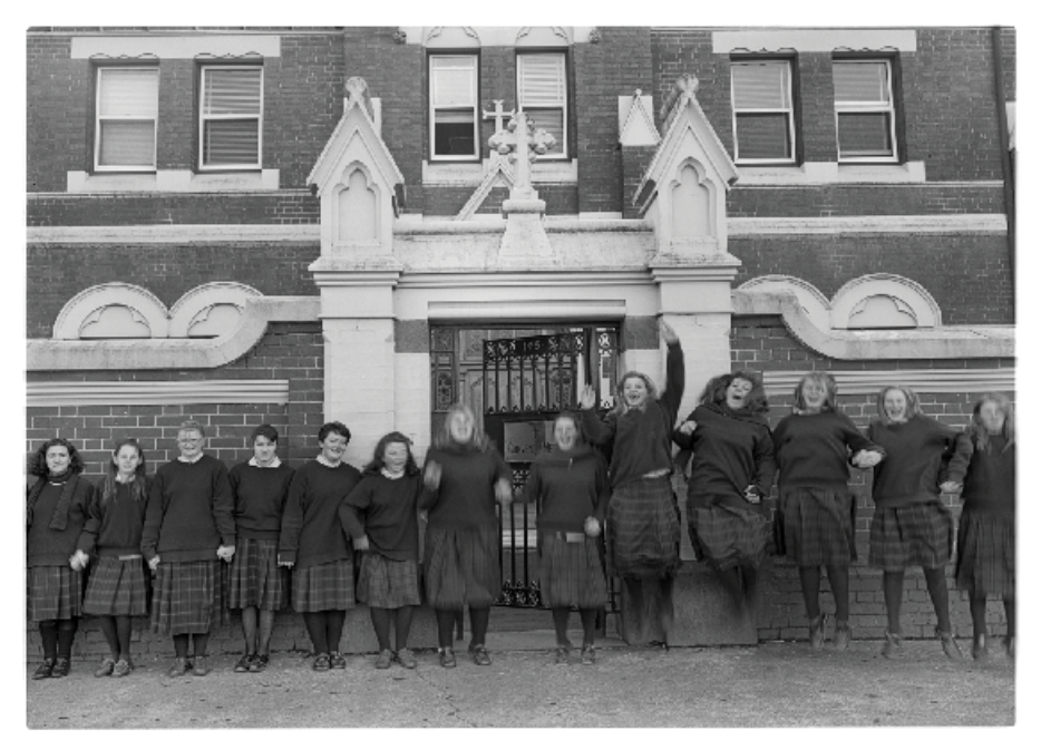
Paul Lambeth, Ballarat East Heritage Project: Sacred Heart Students, Victoria St 1992, printed in 2023 from original 5x4 inch negative, 42cm x 59.4cm, Giclee print on Hahnemuhle photo rag.