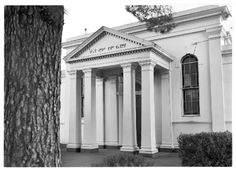
Paul Lambeth, Ballarat East Heritage Project: Synagogue, Barkly Street 1992, printed in 2023 from original 5x4 inch negative, 42cm x 59.4cm, Giclee print on Hahnemuhle photo rag.