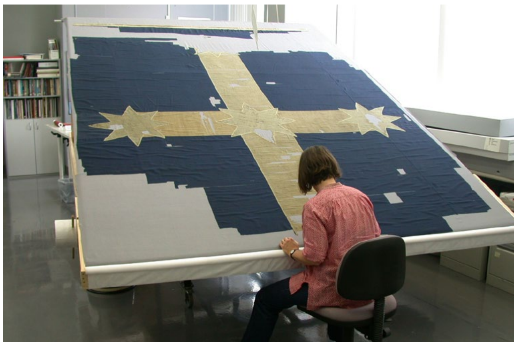
ArtLab conservators working on the Eureka Flag conservation, 2011. Photo, ArtLab

Founder of the Art Gallery of Ballarat James Oddie asked the King family for the flag because of its importance to the history of Ballarat. The King family lent the flag to the Gallery gifting it in 2001. In a practice no longer followed, during the early years at the Gallery, staff occasionally cut pieces off to give as souvenirs to interested people.