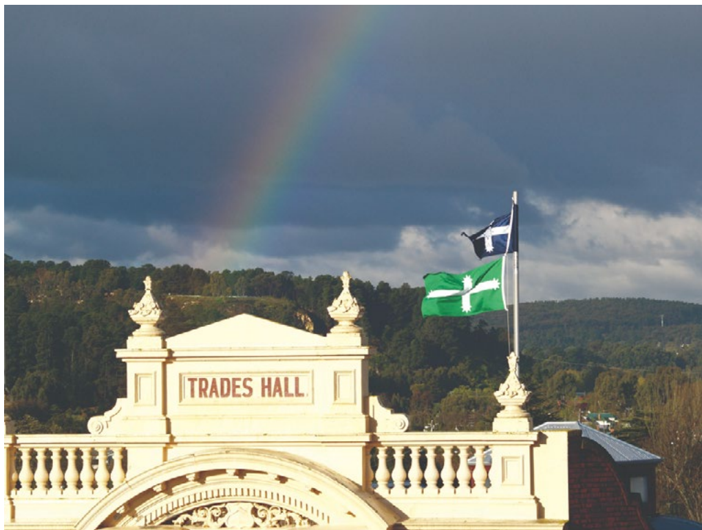
Ash Keating EurEco Revolution 2009. Flag flying over the Ballarat Trades Hall building.