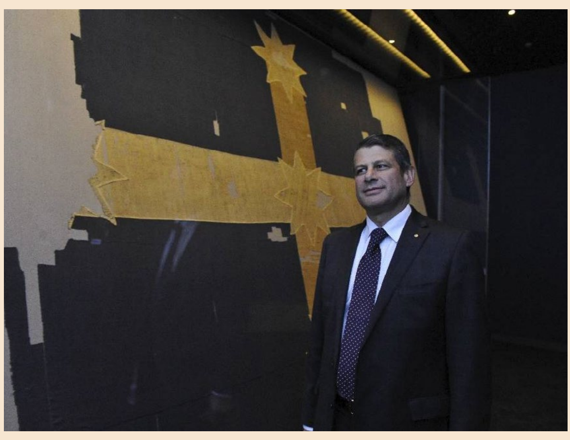
Former Victorian Premier Hon. Steve Bracks with the Flag of the Southern Cross

'I believe Eureka was a catalyst for the rapid evolution of democratic government in this country and it remains a national symbol of the right of the people to have a say in how they are governed. The principles for which the diggers, fought are universal – human rights, justice and tolerance. These priorities are as relevant today as 150 years ago.'