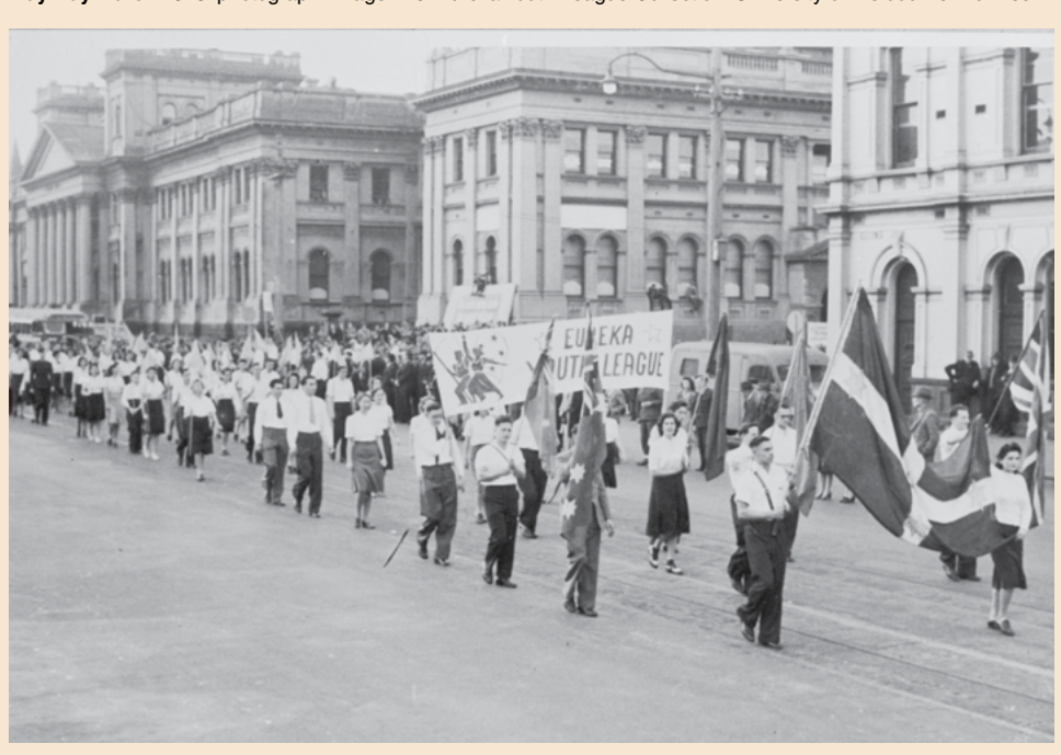
May Day March 1945. photograph. Image 120.

'We should celebrate Eureka and its democratic protests as a landmark event in Australian history. But we should not go too far in celebrating the battle itself, exciting and tragic as it was. To me the main lesson of Eureka is that argument and compromise are more effective than an appeal to arms.'