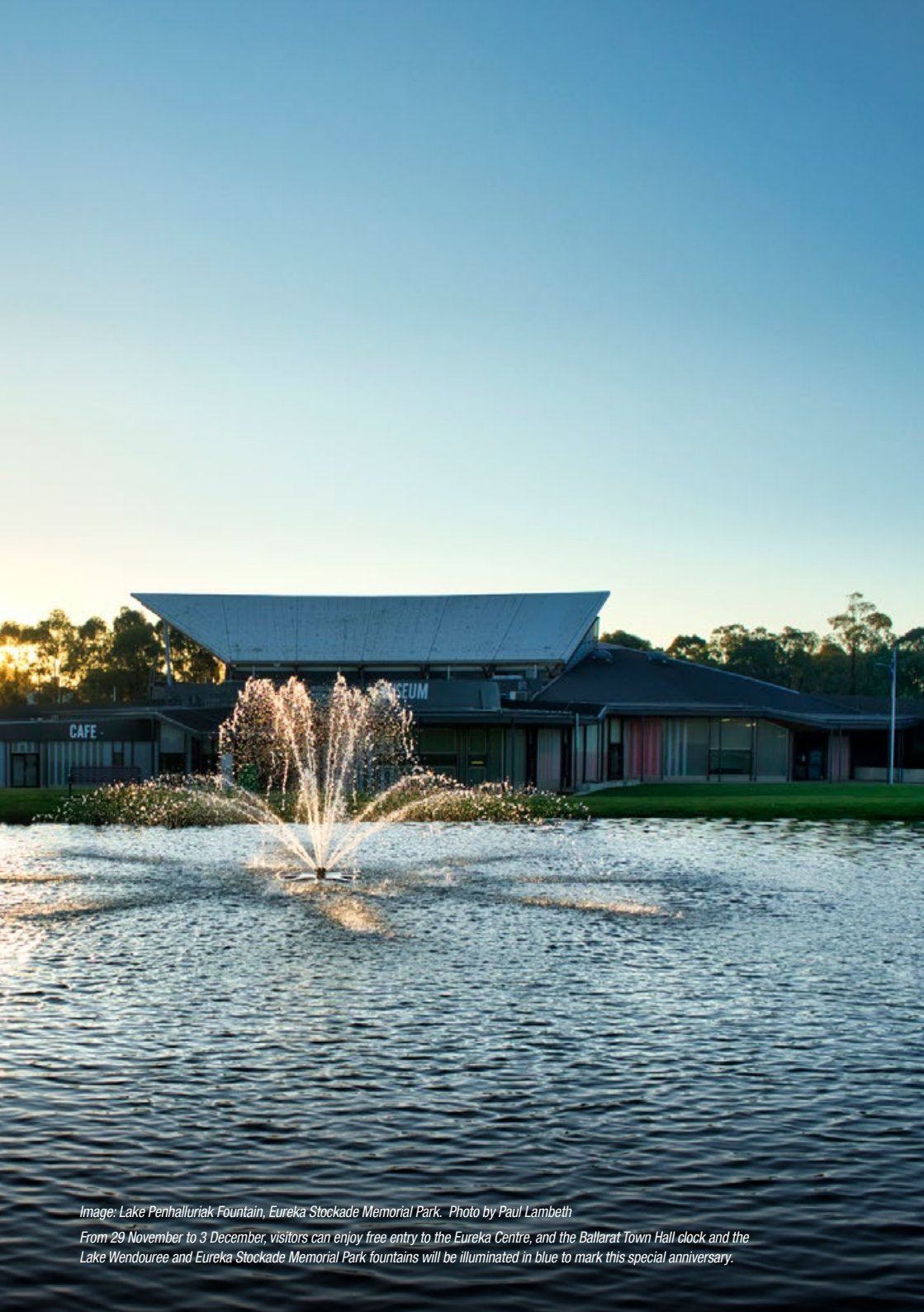
Image: Lake Penhalluriak Fountain, Eureka Stockade Memorial Park.

From 29 November to 3 December, visitors can enjoy free entry to the Eureka Centre, and the Ballarat Town Hall clock and the Lake Wendouree and Eureka Stockade Memorial Park fountains will be illuminated in blue to mark this special anniversary.