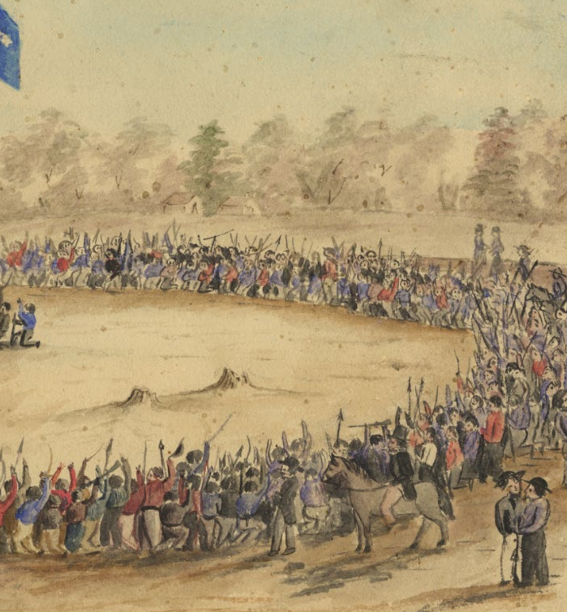
Swearing allegiances to the "Southern Cross"