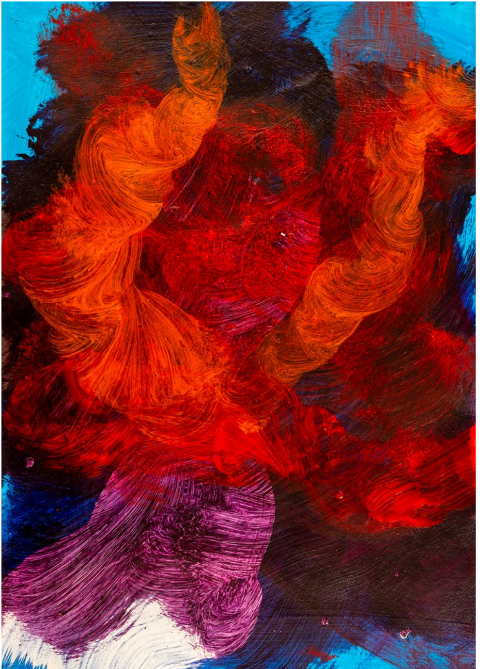
Anthony White, 'After Eureka 3012311' 2023, synthetic polymer paint on Arches 300gsm paper, 42 x 29.5cm, Photo: Carlo Zeccola.